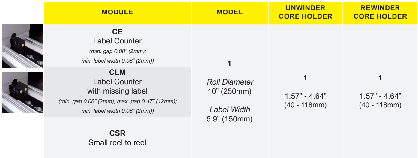
Configuration table - Example CE - 2 - 1 - 1

The "CSR" is a small reel to reel able to rewind your rolls of label with option "label face in" or "label face out".