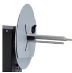
Adjustable core holder