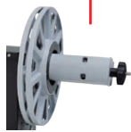
Fixed core holder