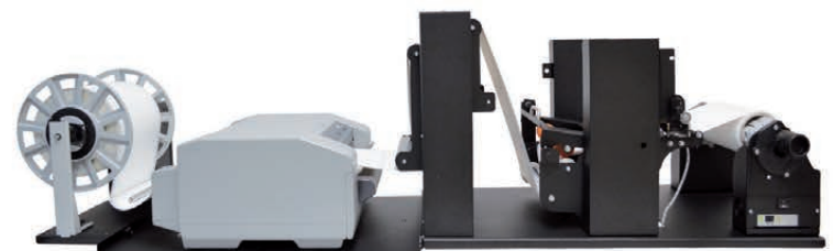
Example of configuration: LABEL UNWINDER - EPSON C831 PRINTER - LABEL SLITTER