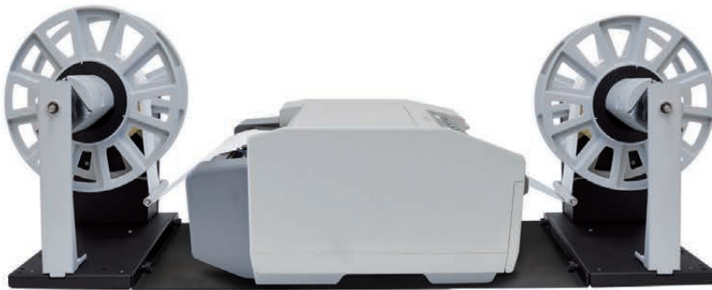
LABEL UNWINDER - EPSON C831 PRINTER - LABEL REWINDER (not included)

The unwinder and rewinder for Epson C831 Inkjet Label Printer make it easy to unwind and rewind large quantities of labels. Capable of handling rolls up to 10" (250mm) diameter and up to 9.45" (240mm) wide, these units improve manufacturing production speed and streamlining the label unwinding / rewinding process.