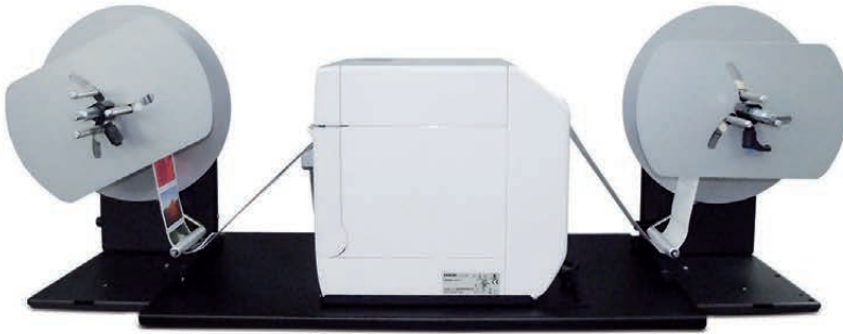
LABEL REWINDER (ASD1111-S0) - Epson TM-C3500 printer - LABEL UNWINDER (ASS1111-S0) (Not included)

The unwinder and rewinder for Epson TM-C3500 printers are used to manage rolls of media up to 5", while having an outside diameter up to 10". Units are equipped with adjustable core holder from 1.57" up to 4.64".