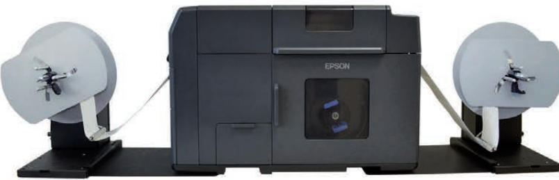
LABEL REWINDER (ASD1111-S0) - Epson C7500 printer - LABEL UNWINDER (ASS1111-S0) (Not included)

An external power supply 100/240VAC - 2.5A \overline{\text{---}} at 24V allows an electronic circuit to provide, through the tension arm, the adjustment of the rotation speed and rotation direction. A 2A fuse is used as protection.