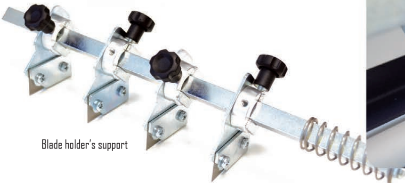
Blade holder's support