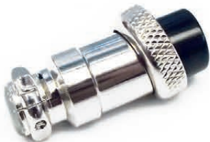
Connector to use the slitter on-line with your label printer

L: 28.34" (720mm) H: 14.56" (370mm) W: 16.73" (425mm) Weight: 55 lbs